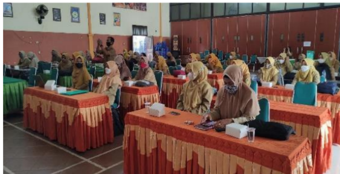
Figure 1. Kindergarten Teacher Participants in Scientific Writing Training Activities

Activities for compiling scientific publications in the form of book chapters for kindergarten teachers. There were 20 participants who took part in the preparation of book chapters from the Kindergarten level. Each kindergarten teacher compiles a book chapter in accordance with the activities that have been carried out in his class or school. Participants collect their assignments on a google drive link that has been prepared by the team. The activities is show in Figure 1 .