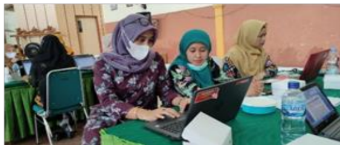
Figure 5. The Instructor is Providing Assistance to Junior High School Teacher Participants in the Scientific Writing Training Activity

There were 20 participants who took part in the preparation of book chapters from the junior high school level. Each junior high school teacher prepares draft articles based on CAR activities that have been carried out in their class or school. Based on the results of reflections carried out after each activity session, the results showed that the teachers found it helpful to change the report form into a draft publication article. This increases the added value and enhances the professional quality of each teacher. In addition, teachers also gain new understanding regarding technological literacy by using delay-based software. The activity of scientific writing training activities of junior high school teacher is show in Figure 5 .