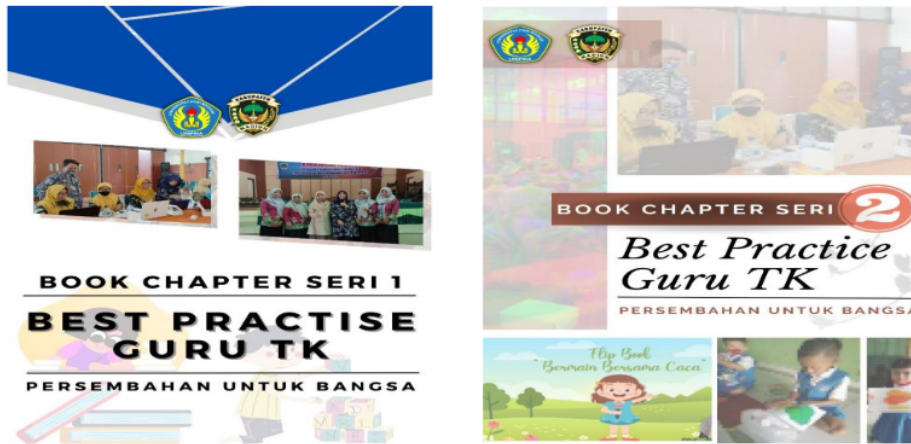
Figure 2. Cover Page of Book Elementary School Teachers in Scientific Writing Training Activities

Based on Figure 1, participants participated in the whole series of activities with enthusiasm and enthusiasm. The results of daily reflection based on the activities carried out show that teachers feel they have gained new knowledge, especially about how to write scientific publications in the form of book chapters. In terms of content, the average teacher already has the provisions to be poured in written form. However, technically, such as the ability to compose writing, understand the form of writing according to the template, arrangement and adjustment of content with previous references, it is still weak. The results of the book chapter will be compiled in the form of an ISBN book which is currently still in the confirmation stage with the participants due to the printing costs for the book. While the cover layout that has been prepared is show in Figure 2.