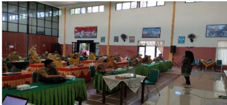
Figure 4. The Level of Plagiarism of Scientific Articles for Elementary School Teachers Participating in the Training

The results of reflections carried out after each activity session, the results showed that the teachers found it helpful to change the report form into a draft publication article. This is felt to increase the added value and improve the quality of the professionalism of each teacher. In addition, teachers also gain a new understanding of technological literacy by using the Mendelay software. The data from the draft articles produced by each teacher was carried out by the Turnitin test to determine the level of plagiarism. Turnitin's data shows that the level of plagiarism of participants' scientific articles is still high. Only 2% of training participants' articles have a plagiarism rate below 30%. The distribution of plagiarism levels of scientific articles by elementary school teacher participants can be seen in Figure 4 . This condition shows that teachers still need practice as a habit to compose paraphrases from quotes in reference sentences.